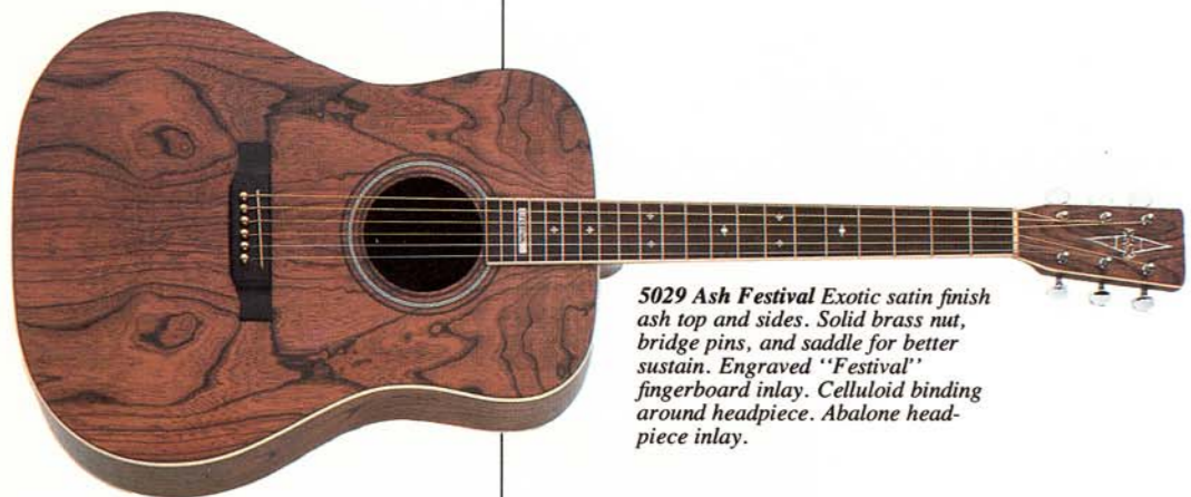
5029 Ash Festival Exotic satin finish ash top and sides. Solid brass nut, bridge pins, and saddle for better sustain. Engraved "Festival" fingerboard inlay. Celluloid binding around headpiece. Abalone headpiece inlay.