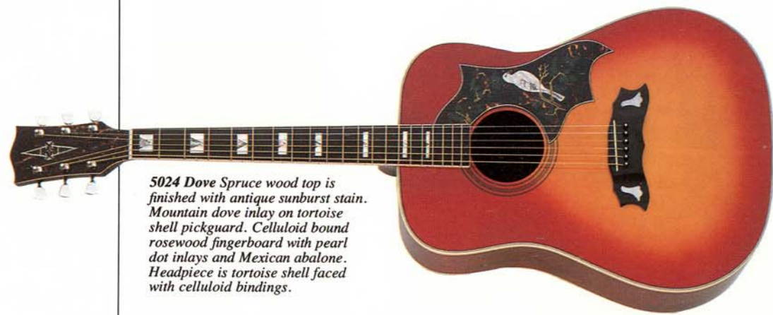
5024 Dove Spruce wood top is finished with antique sunburst stain. Mountain dove inlay on tortoise shell pickguard. Celluloid bound rosewood fingerboard with pearl dot inlays and Mexican abalone. Headpiece is tortoise shell faced with celluloid bindings.