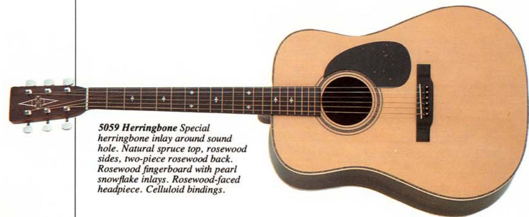
5059 Herringbone Special herringbone inlay around sound hole. Natural spruce top, rosewood sides, two-piece rosewood back. Rosewood fingerboard with pearl snowflake inlays. Rosewood-faced headpiece. Celluloid bindings.