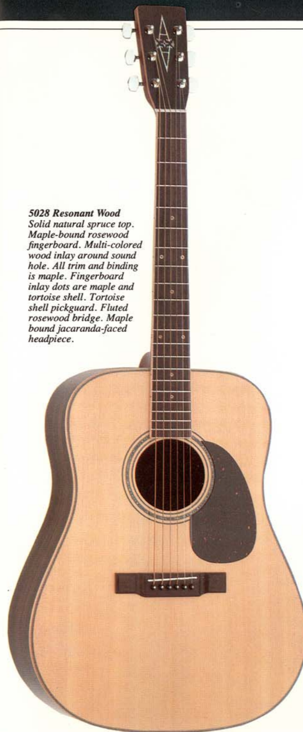
5028 Resonant Wood Solid natural spruce top. Maple-bound rosewood fingerboard. Multi-colored wood inlay around sound hole. All trim and binding is maple. Fingerboard inlay dots are maple and tortoise shell. Tortoise shell pickguard. Fluted rosewood bridge. Maple bound jacaranda-faced headpiece.