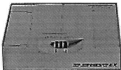
The JetDirect interface connects to your printer via the Parallel I/O port.

Use the HP JetDirect EX interface to connect parallel-based printers anywhere on an Ethernet or Token Ring LAN. Fully compliant with Novell Netware security features, the JetDirect features automatic network/protocol switching for simplified printing in mixed environments, with data transfer rates of up to 230 Kbps. Flash memory makes it easy to upgrade software over the network.