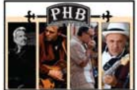
12:20 PM – PHB All-Stars “Dis” Stage