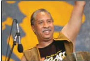
4:40 PM – Zigaboo Modeliste “Dat” Stage

In a rare appearance, Zigaboo Modeliste will deliver authentic Big Easy sounds. “Ziggy” is a living legend, best known as a founding member and lyricist of the funk group The Meters. He has written over 200 songs individually and collectively with The Meters . Modeliste is one of the most innovative and highly acclaimed drummers ever to hail from New Orleans and a pioneer of second-line funk. He also cofounded The Wild Tchoupitoulas and has worked extensively with famous musicians, notably Keith Richards, Robert Palmer, Allen Toussaint, Professor Longhair and Dr. John.