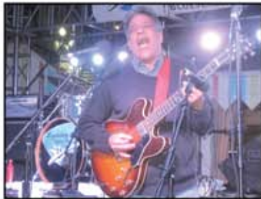
3:30 PM – Ray Charles Project “Dis” Stage